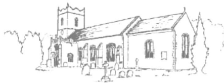
St Peter's Church